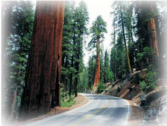
General's Highway Sequoia National Park