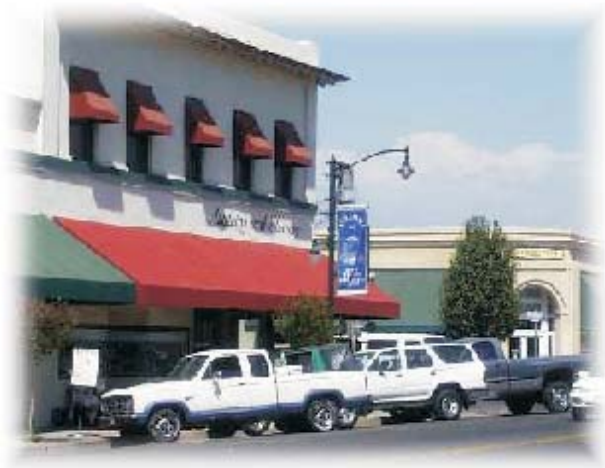
City of Exeter Downtown